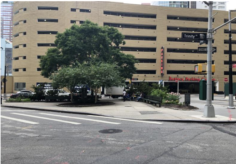
2 Edgar St, New York, NY 10006 (east of the parking garage)

EVACUATION FROM DEVOS HALL: go to Elizabeth Berger Plaza.